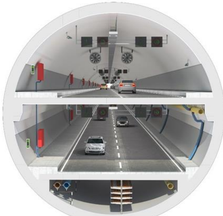
Image 9 Avrasya Tunnel 16

There are some big projects as 3th Bosphorus Bridge, Bosphorus Tube Way, Gulf Bridge, Third Airport and Channel Istanbul in Turkey in order to become most whealty and developed country in the World. Benzeri projeleri bırakın bir arada herhangi bir ülkenin yürütmesini her birini yürütecek farklı ülkeler bile bulunmamaktadır.