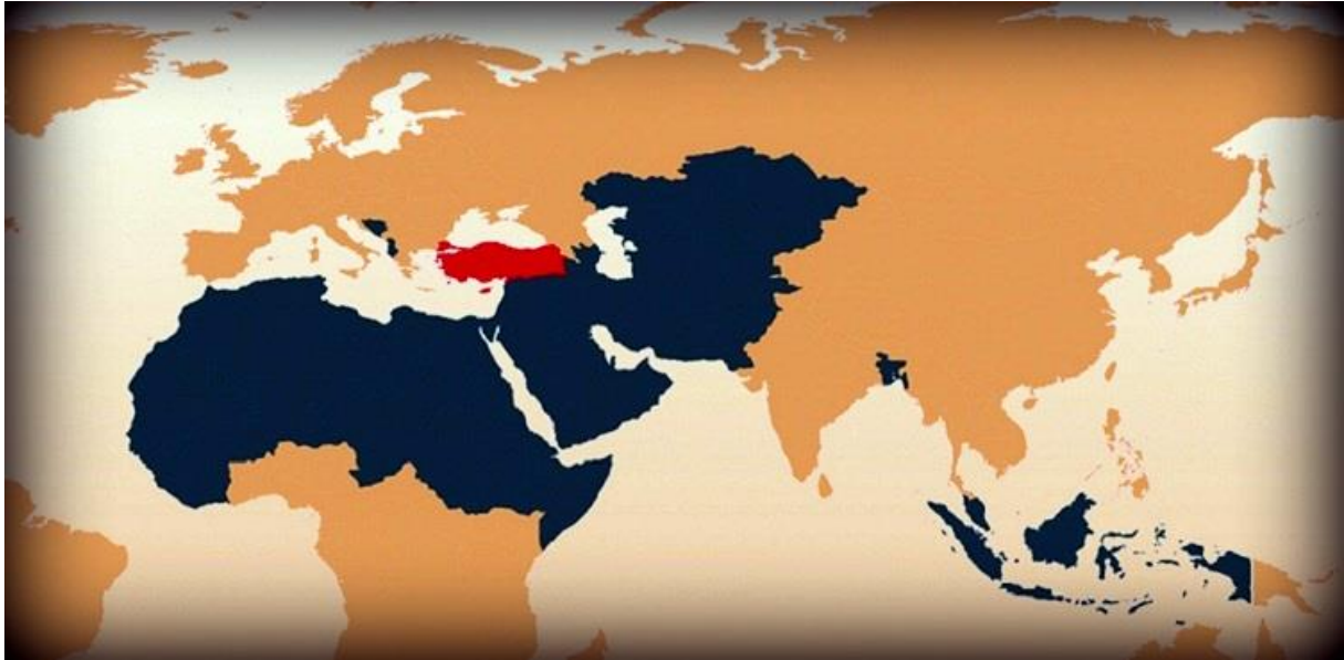
Image 16 SADAT's potantial clients 23

Everything is so clear, what is the meaning of purpose is to write illegal things, that there are various suspicions about SADAT ?