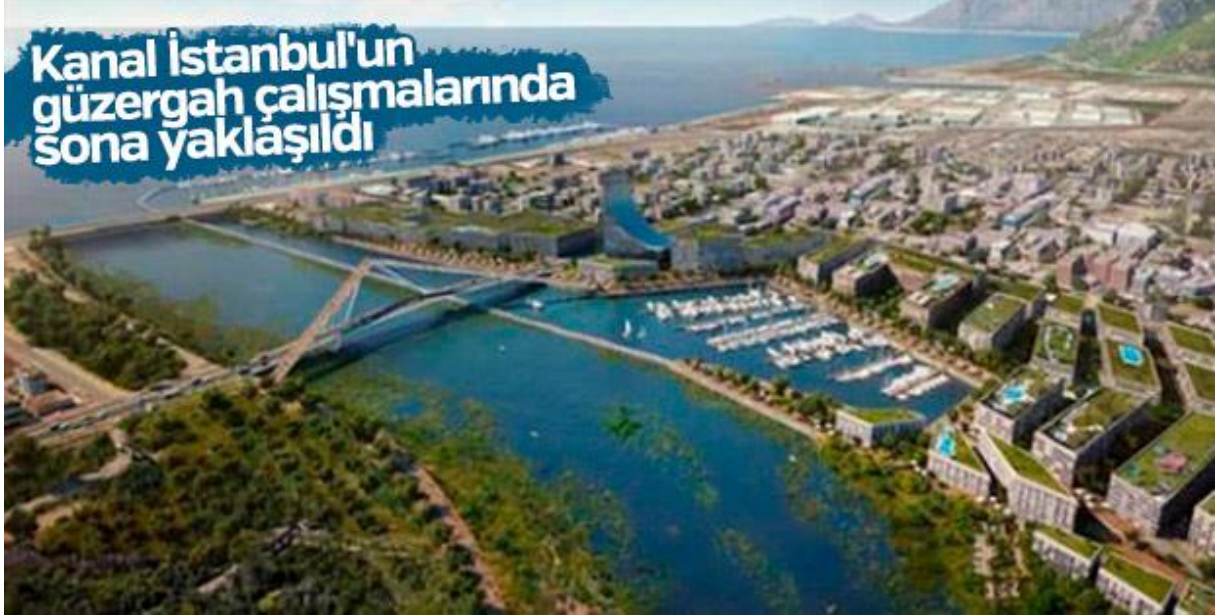
Image 12 The Route Is Set In Channel Istanbul 19

Form No RPR. DAN. 01 Publishing Date 28. 06. 2013 Page No 24 / 44 Revision Date 30. 06. 2017 Revision No 1