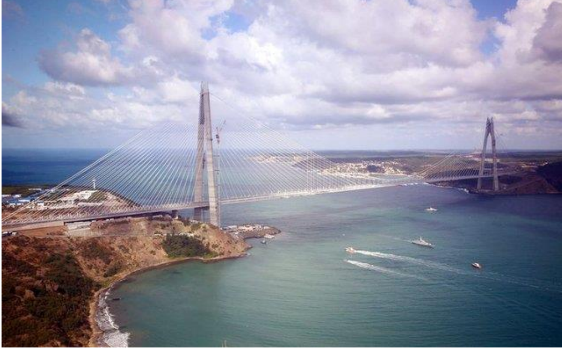
Image 10 Yavuz Sultan Selim Bridge / 3. Bridge 17

Form No RPR. DAN. 01 Publishing Date 28. 06. 2013 Page No 23 / 44 Revision Date 30. 06. 2017 Revision No 1