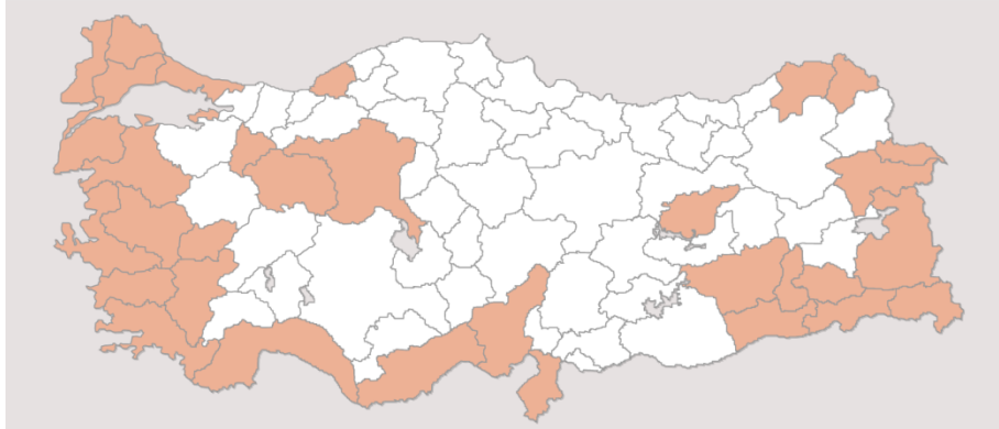
Image 8 Results of Referendum 15