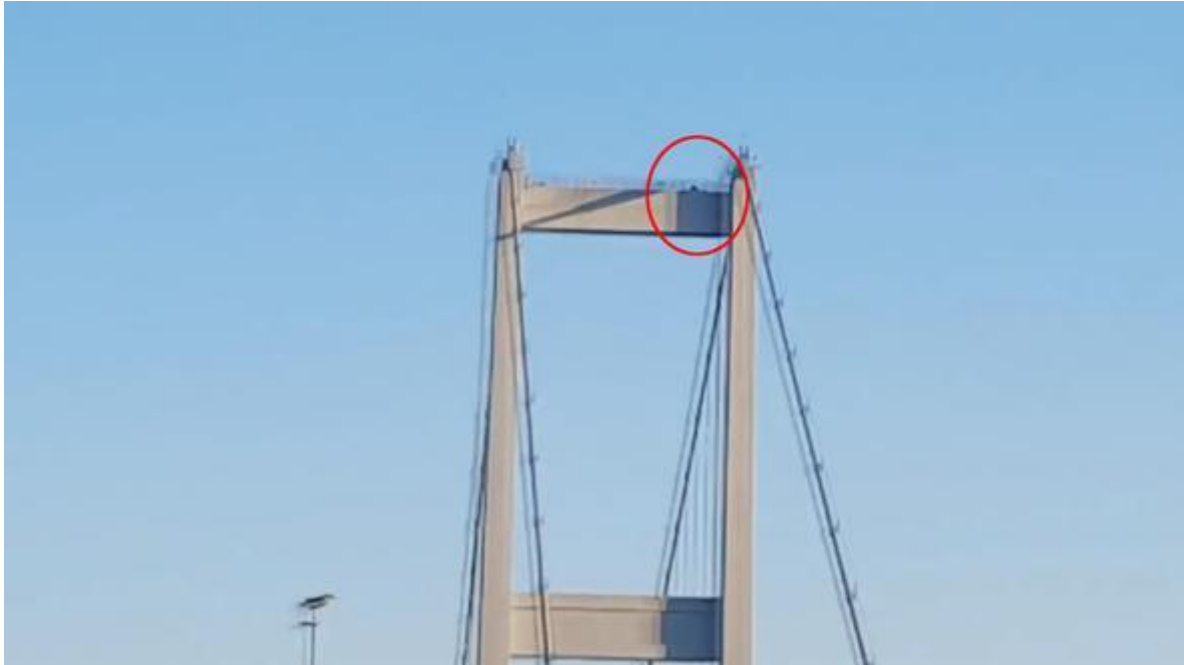
Image 3 July 21, 2016 dated Hürriyet News http://www.hurriyet.com.tr/koprude-keskin-nisanci-varmis-40156647