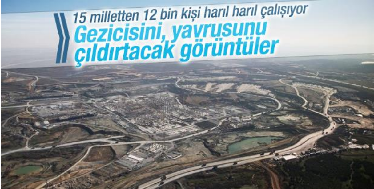
Image 11 Third Airport Construction 18