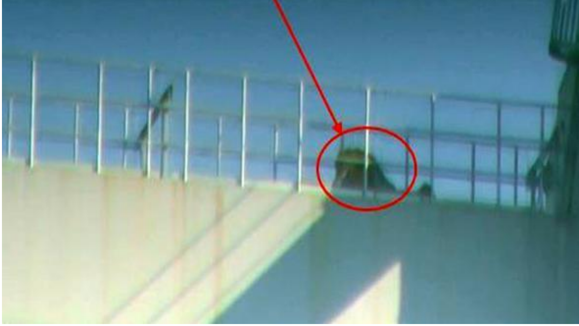
Image 5 Lift's zoom photo on the bridge 5

However, those who carry out the lie campaign do not hesitate to spread any kind of suitable for their own interests. They don't know the border to morality.