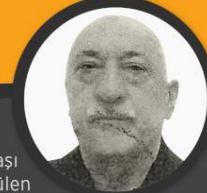
FETÖ elebaşı Fetullah Gülen

FETÖ'nün darbe girişimine ilişkin 62 ilde 6 bin 880 sanık hakkında 269 dava açıldı