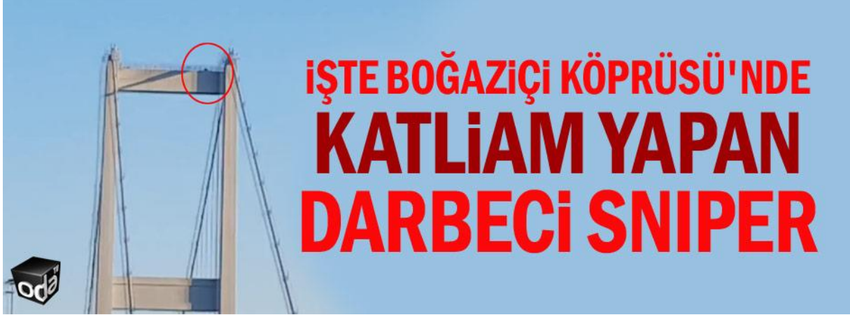
Image 2 July 21, 2016 dated OdaTV news that creating a sniper perception with photo at daylight

Claiming that there was a sniper, who killed lots of people, on the bridge. To be convincing, they show this picture as you see there is only a tarnish. 2 3