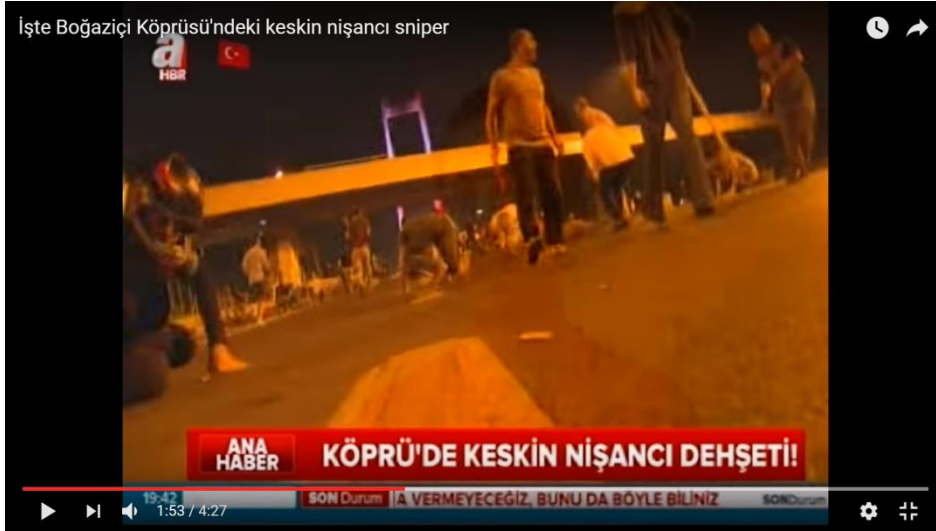
Image 4 July 21, 2017 dated aHBR news 4

There is a photo, which is taken from a tv channel news, claiming the scandal campaign,. At that time, clearly it is night...