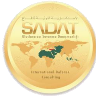
Image 1 Countries In Our Client Portfolio

SADAT Inc. mission is limited with friends and allies countries, so mentioned the countries its logo.